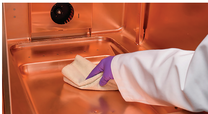
Figure 2. With shelves and cover removed, the integrated water reservoir is completely accessible for easy cleaning.