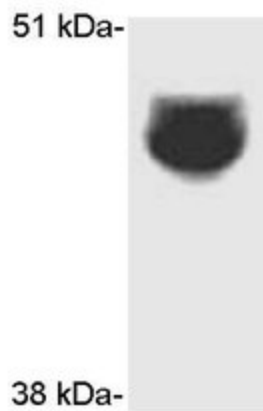
Figure 1 illustrates Western blot detection of cytochrome P450 3A4 from rat liver extract using Product # PA1-343.