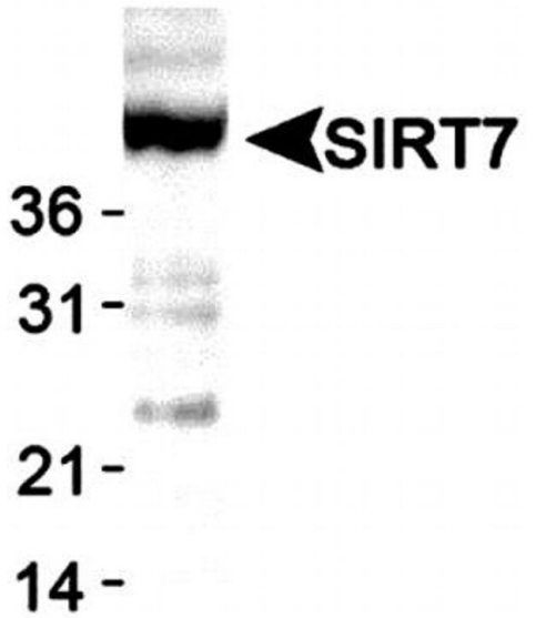
SIRT7 Antibody (PA1-46468) in WB Western blot analysis of SIRT7 in tissue lysates of human liver. Sample was incubated in SIRT7 polyclonal antibody (Product # PA1-46468).