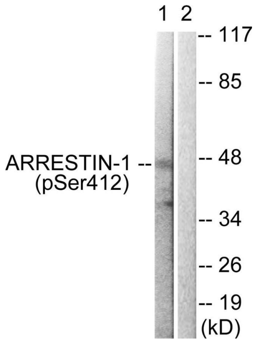
Phospho-beta Arrestin 1 (Ser412) Antibody (PA5-38259) in WB Western blot analysis of Phospho-beta-Arrestin 1 pSer412 in extracts from COS7 cells using a Phospho-beta-Arrestin 1 pSer412 polyclonal antibody (Product # PA5-38259).