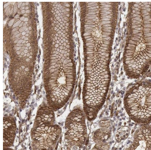
ZFYVE19 Antibody (PA5-65320) in IHC Immunohistochemical staining of ZFYVE19 in human stomach shows cytoplasmic positivity in glandular cells. Samples were probed using a ZFYVE19 Polyclonal Antibody (Product # PA5-65320).