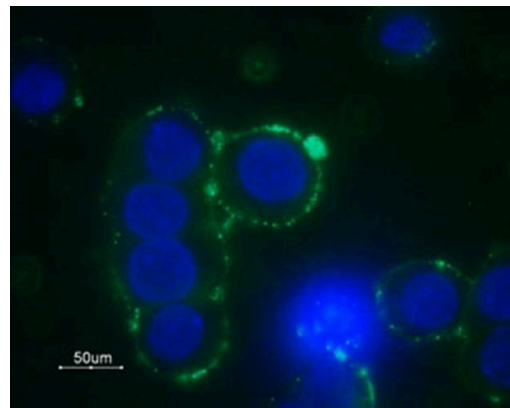
alpha-1b Adrenergic Receptor (extracellular) Antibody (PA5-77285) in ICC/IF Immunocytochemistry analysis of alpha-1b Adrenergic Receptor (extracellular) in GH3 cells. Samples were probed with alpha-1b Adrenergic Receptor (extracellular) polyclonal antibody (Product # PA5-77285) and incubated with goat anti-rabbit-AlexaFluor-488 and Hoechst.