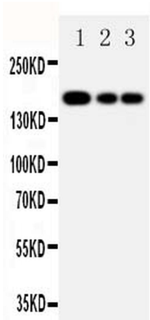
MRP1 Antibody (PA5-78694) in WB Western blot analysis of MRP1 in Lane 1: JURKAT cell lysate, Lane 2: CEM cell lysate, Lane 3: A549 cell lysate. Sample was incubated with MRP1 polyclonal antibody (Product # PA5-78694).