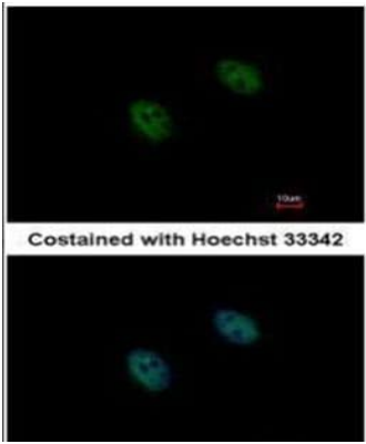
DUSP2 Antibody (PA5-28775) in ICC/IF Immunofluorescent analysis of DUSP2/PAC1 in paraformaldehyde-fixed HeLa cells using a DUSP2/PAC1 polyclonal antibody (Product # PA5-28775) at a 1:1000 dilution.