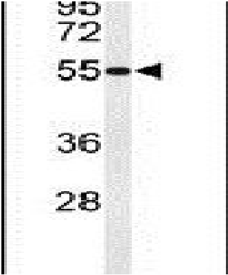
HIAT1 Antibody (PA5-26974) in WB Western blot analysis using a HIAT1 polyclonal antibody (Product # PA5-26974) in CHO cell lysates (35 µg per lane).