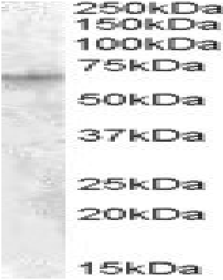
IGF2BP2 Antibody (PA5-18865) in WB Western blot analysis of IGF2BP2 using IGF2BP2 Polyclonal Antibody (Product # PA5-18865) (1 µg/mL) in staining of HepG2 cell lysate (35 µg protein in RIPA buffer). Primary incubation was 1 hour. Detected by chemiluminescence.