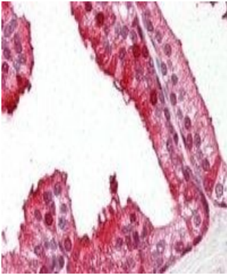
PEBP1 Antibody (PA1-31551) in IHC (P) Immunohistochemistry (Paraffin) analysis of PEBP1 in human prostate tissue using PEBP1 Polyclonal Antibody (Product # PA1-31551) at a dilution of 5 µg/mL. Antigen retrieval : citrate buffer pH 6.