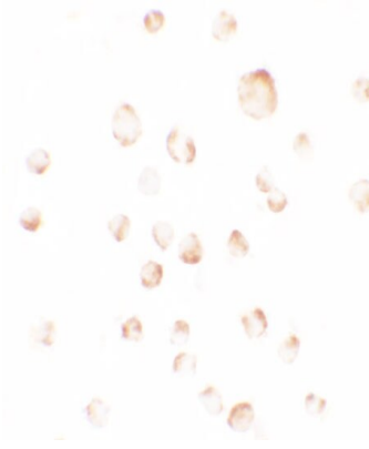
PHLPP1 Antibody (PA5-34434) in ICC/IF Immunocytochemistry of PHLPP1 in SW480 cells with PHLPP1 Polyclonal Antibody (Product # PA5-34434) at 2.5 µg/mL.