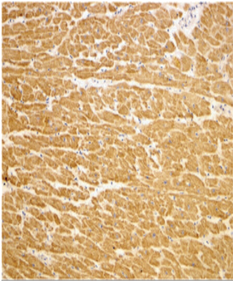
TIRAP Antibody (PA5-20028) in IHC Immunohistochemical staining of human heart tissue using TIRAP Polyclonal Antibody (Product # PA5-20028) at 2 µg/mL.