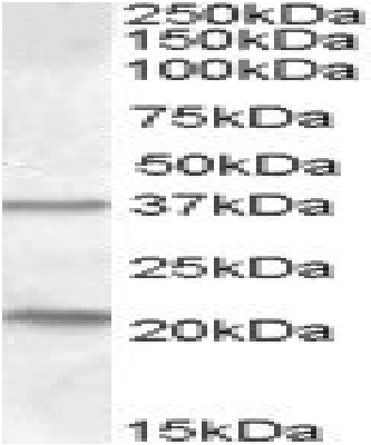
TUSC3 Antibody (PA5-18893) in WB Western blot analysis of TUSC3 using TUSC3 Polyclonal Antibody (Product # PA5-18893) (1 µg/mL) in staining of Human Liver lysate (35 µg protein in RIPA buffer). Detected by chemiluminescence.