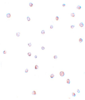
USP10 Antibody (PA5-20987) in ICC/IF Immunocytochemistry of USP10 in Jurkat cells with USP10 Polyclonal Antibody (Product # PA5-20987) at 20 µg/mL.