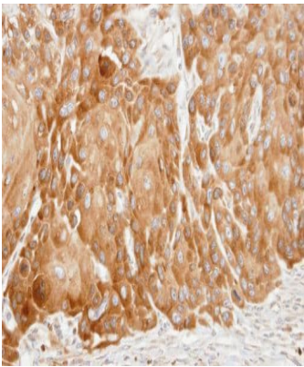
VDP Antibody (PA5-28427) in IHC (P) Immunohistochemical analysis of paraffin-embedded SCC15 xenograft, using VDP/p115 (Product # PA5-28427) antibody at 1:100 dilution. Antigen Retrieval: EDTA based buffer, pH 8.0, 15 min.